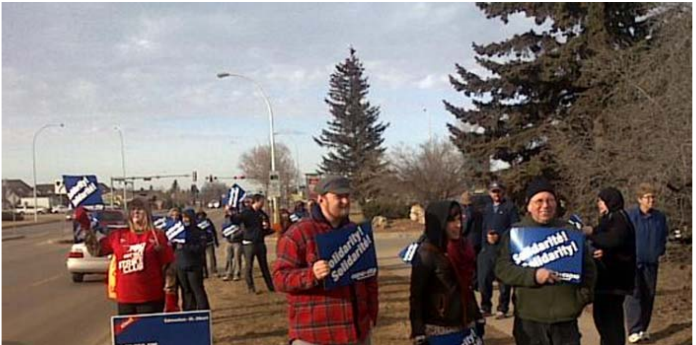
St. Albert RSMC and Solidarity Supporters